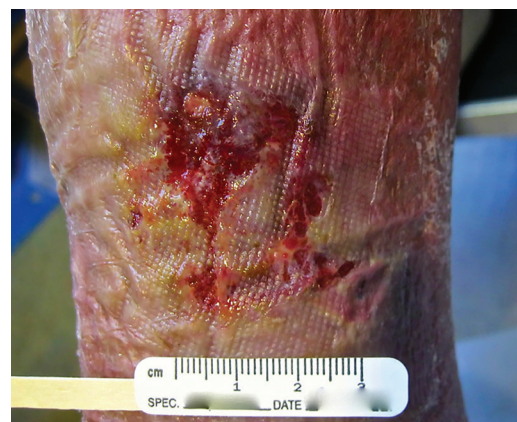
8/24/14 (WEEK 10)